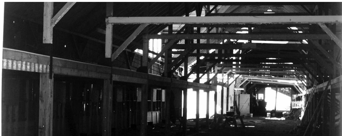
This interior of one wing of the stables is part of the overall work in progress of the Simmons Stables Preservation Fund, Inc. The group started construction on the buildings in October 2008.

Simmons Stables famously produced many harness-class champions as well including six-time world champion Colonel Boyle, Tashi Ling, Stonewall Lee, Vanity Again, Perfect Stranger,