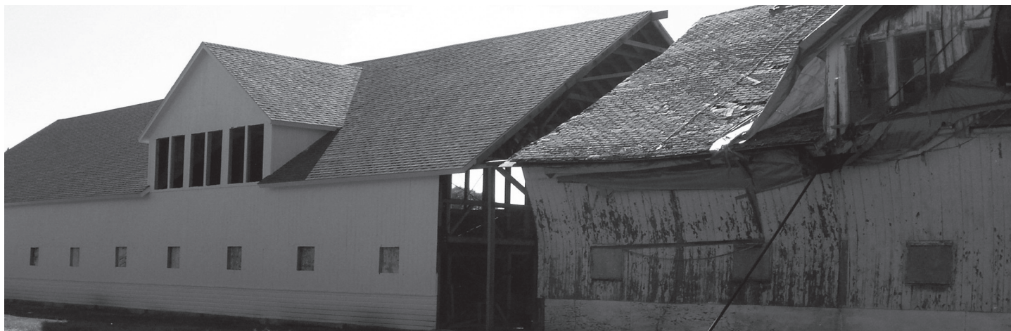
One wing of the stables shows the exterior on its way to being finished. The next section has not received any treatment as yet.

To recreate and refurbish the instantly recognizable entrance to the stables, the workers used